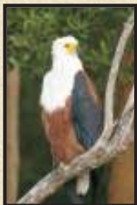
BIRD VIEWER'S PARADISE